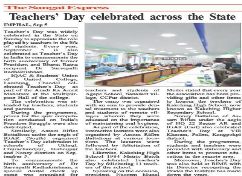
Figure 1: Celebration of Teacher's Day

IQAC & Students' Union of united College, Lambung, Chandel observed Azadi ka Amrit Mahotsav with an observation of the 41 st Teacher's Day Celebration in the Multipurpose Hall of this College. The function was attended by teachers, students and parents. The prize distribution for the quiz competition on India's freedom struggle of the students was conducted on this special occasion.