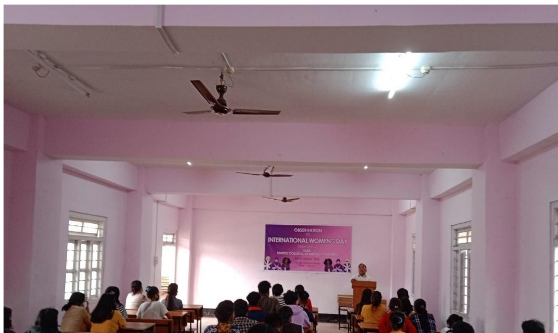
Figure 3: Celebration of International Women's Day

The College hosted the International Women's Day celebration in the Science Block at 1 PM on 8th March, 2022.